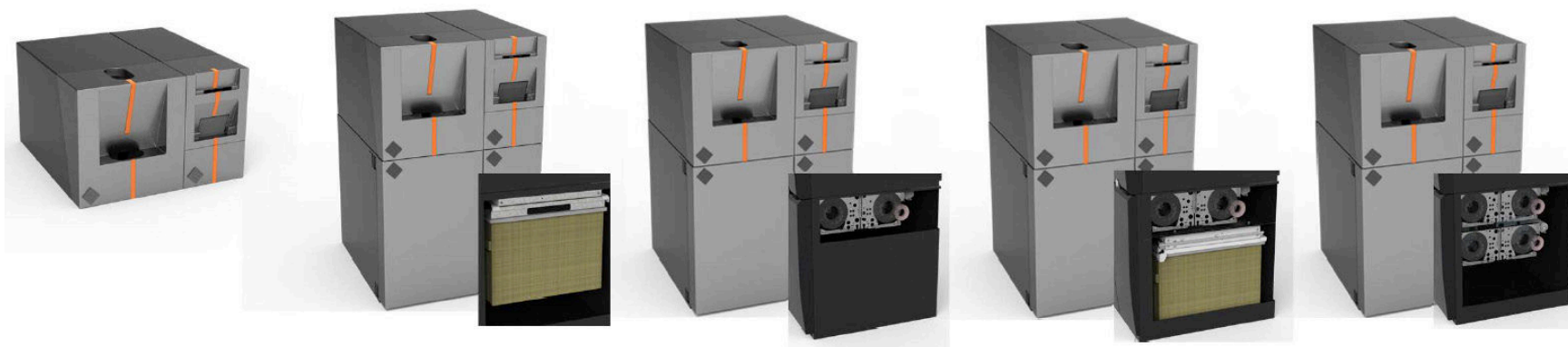
INLANE 300 DESKTOP