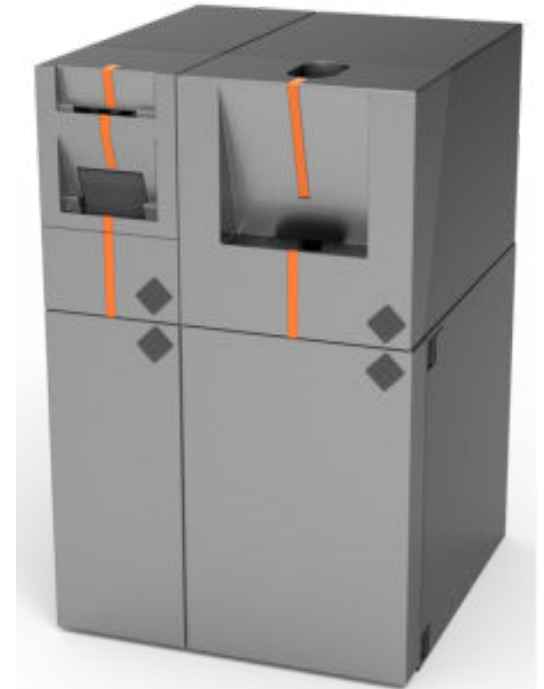
Free standing or in-counter unit