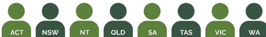
FIGURE 1: AUSTRALIA'S NATIONAL LANDCARE NETWORK – HOW WE WORK