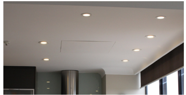
(Upgraded Kitchen - After)