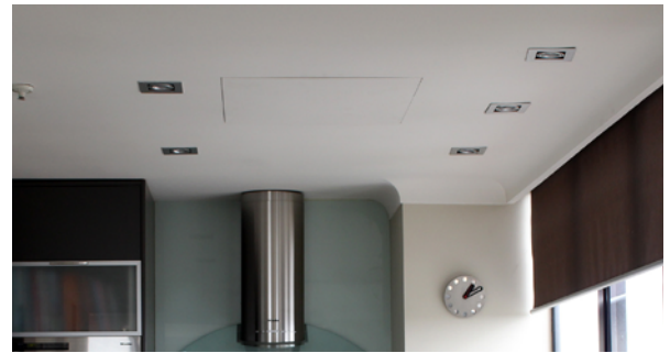
(Kitchen with halogen downlights - Before)