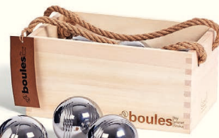
premium boules in carry crate (6)

Boules by Planet Finska comes in black carry bag or hardwood carry crate. Both include six polished steel boules, wooden cachonet and measuring string. Our premium set in carry crate has an extra cachonet and wooden measuring toggle, both of which are finished in a high gloss protective varnish