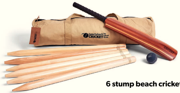
6 stump beach cricket

Why buy plastic when timber is an option! Our hardwood beachshack cricket is incredibly good value when compared to inferior and environmentally poor plastic sets. The varnished bat is perfect for kids and adults alike and has been crafted with a classic longboard twin stripe timber design. The chunky 4cm hardwood stumps are polished smooth and also varnished. All Beachshack Cricket sets come with rubber high bounce beach cricket ball and quality embroidered canvas duffel bag.