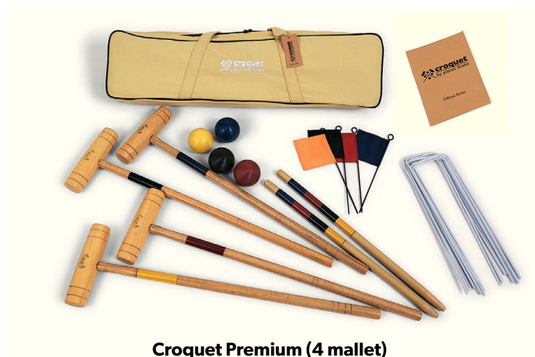
Croquet Premium (4 mallet)

Croquet Family is available as a 4 player set with smaller family friendly sized mallets and balls and comes in a superior black nylon carry bag.