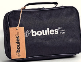
boules in bag (6)

Bocce by Planet Finska has 8 big and bold 100mm bocce balls and a 50mm white pallino. All are crafted from superb polished resin. Bocce comes in either a solid hardwood carry crate or heavy duty embroidered carry bag. Bocce is suitable for 2 or 4 players as there are 4 black and 4 olive balls with 2 pattern markings in each colour.