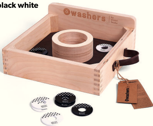
washers - black white