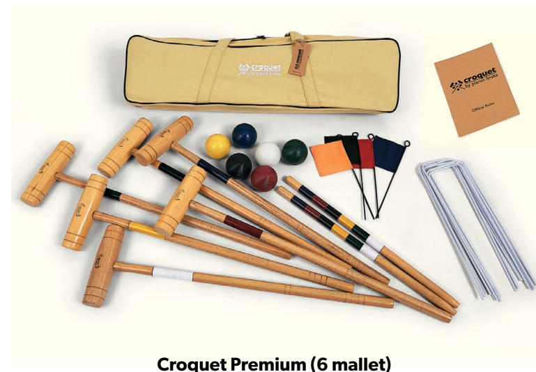
Croquet Premium (6 mallet)

Croquet Premium comes as either a 4 or 6 player set. Croquet Premium mallets and balls are full size and each set comes in a heavy duty canvas carry bag. Each set also includes 9 enamel coated steel wickets, starting and finishing stakes and 4 corner flags.