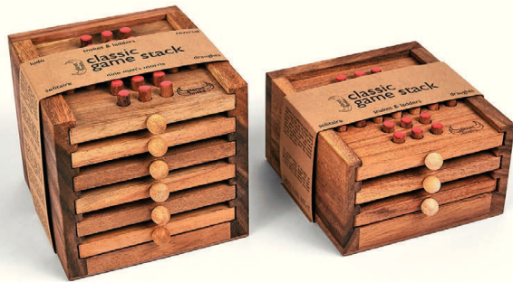
6 drawer game stack