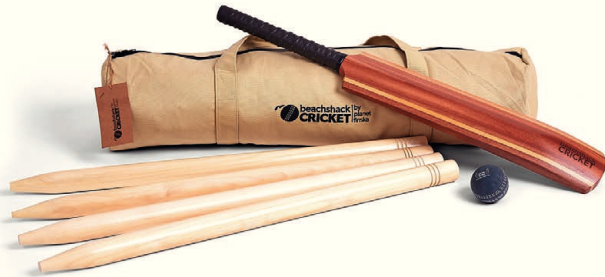
4 stump beach cricket