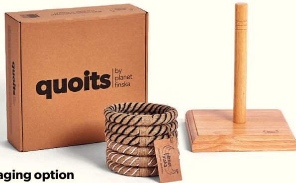
new packaging option

Solid hardwood block & peg with six traditional wire centred quoits. Each set has a 3.4cm thick base that will not tip over and a threaded timber pole that will not wobble or loosen over time. Each set is finished in a gloss varnish to beautify and preserve the timber. Quoits can now be purchased with or without packaging.