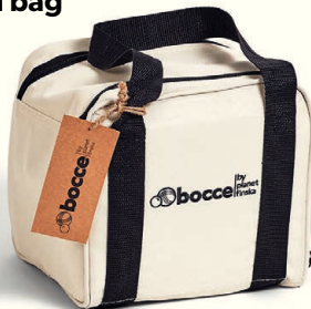
bocce in bag