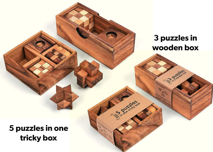
3 puzzles in wooden box